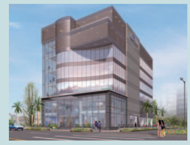
The Lounge, Chetla, Kolkata