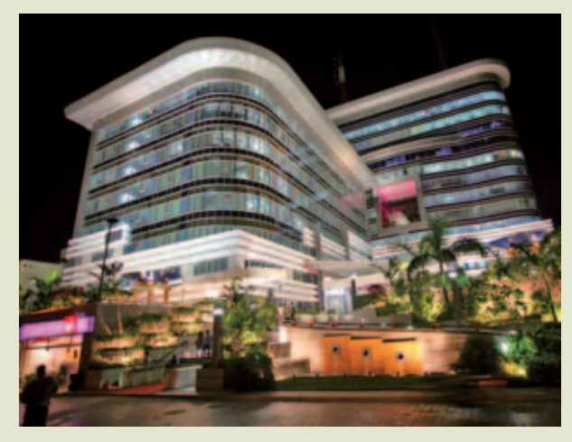
Millennium City IT Park, Sector V, Kolkata